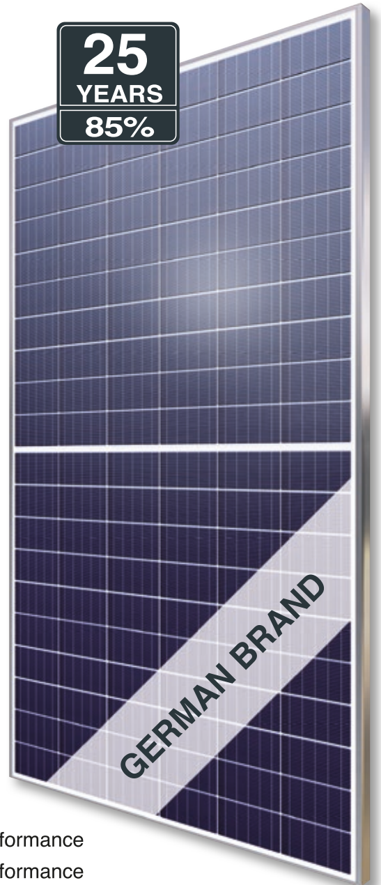
Fig. similar 120MHEN210203A

Exclusive linear AXITEC high performance guarantee!